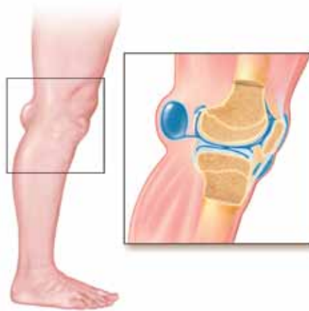
A Baker's cyst is a fluid-filled sac that may cause swelling behind the knee.

A Baker's cyst may disappear on its own. If the cyst is caused by an under-