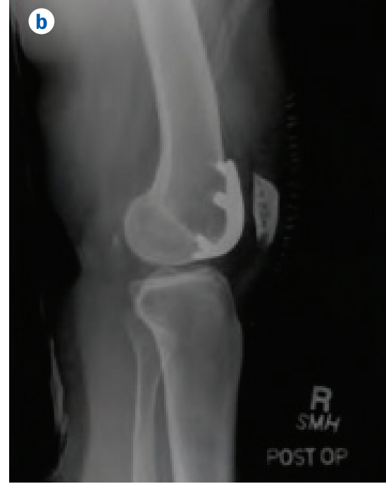
Figure 1. Post-operative radiographs of (a) anterior-posterior and (b) lateral views of patellofemoral arthroplasty.