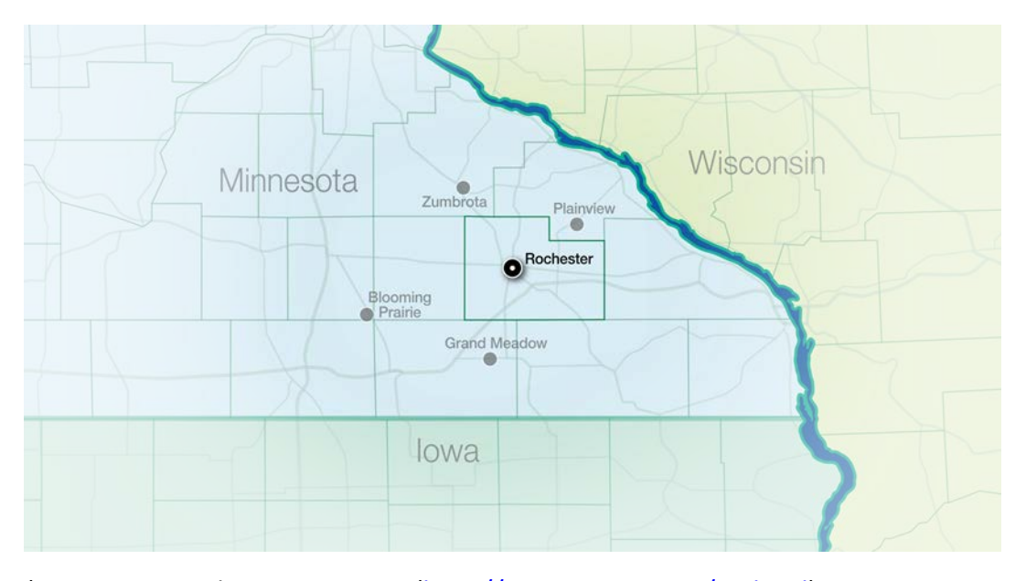
*2015 estimated per U.S Census (http://www.census.gov/en.html)

Mayo Clinic Hospital in Rochester provides critical and complex tertiary care to Mayo Clinic Health System patients, as well as patients referred from primary care providers throughout the U.S. and world. Through numerous outpatient facilities, Mayo Clinic in Rochester provides a complete spectrum of primary care to community patients in Olmsted County. For patients living outside of the county, primary care is provided through Mayo Clinic Health System (MCHS). CHNAs from nearby MCHS hospitals within the rural geographic regions of southern Minnesota, western Wisconsin and northern lowa collectively represent the regional reach and breadth of Mayo Clinic's primary and community health care.