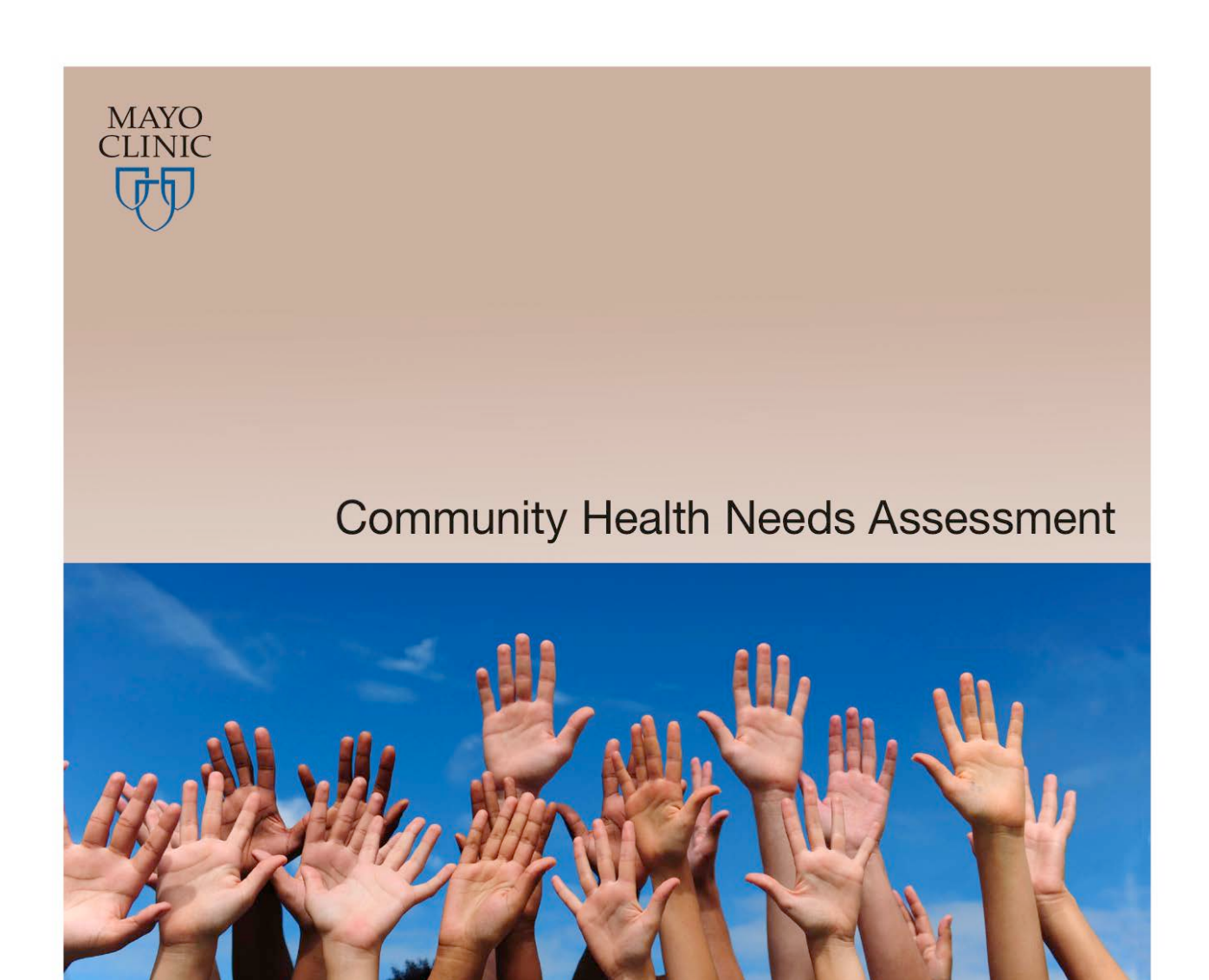
Mayo Clinic Hospital - Rochester