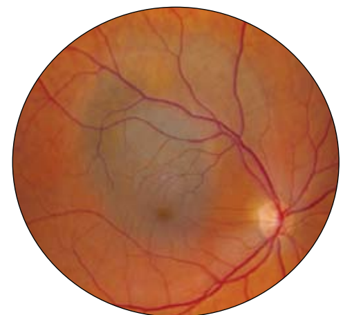
Figure 1. Choroidal melanoma.