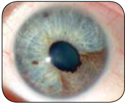
Figure 2. Iris melanoma.