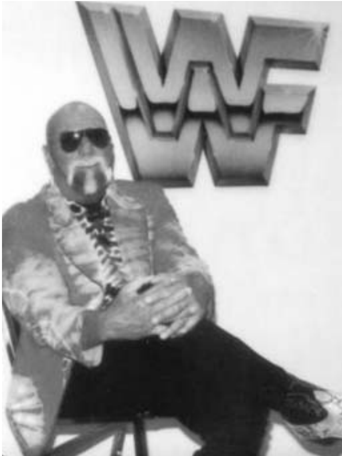
Wayne Coleman – A “Superstar” for all new reasons.

For “Superstar” Billy Graham, the biggest battle of his life occurred outside the wrestling ring. Graham, whose real name is Wayne Coleman, was an icon on the mat in the 1970s and 80s, during which time he grappled with some notoriously unruly opponents.