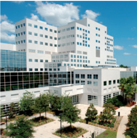
Mayo Clinic in Florida