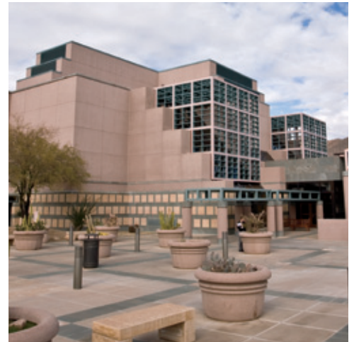
Mayo Clinic in Phoenix/Scottsdale, Arizona

“The glory of medicine is that it is constantly moving forward, that there is always more to learn.”