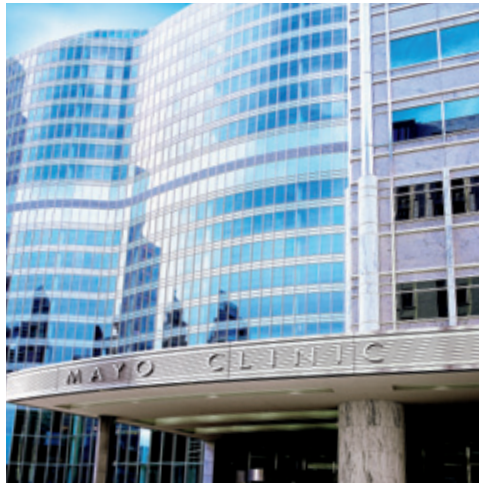
Mayo Clinic in Rochester, Minnesota