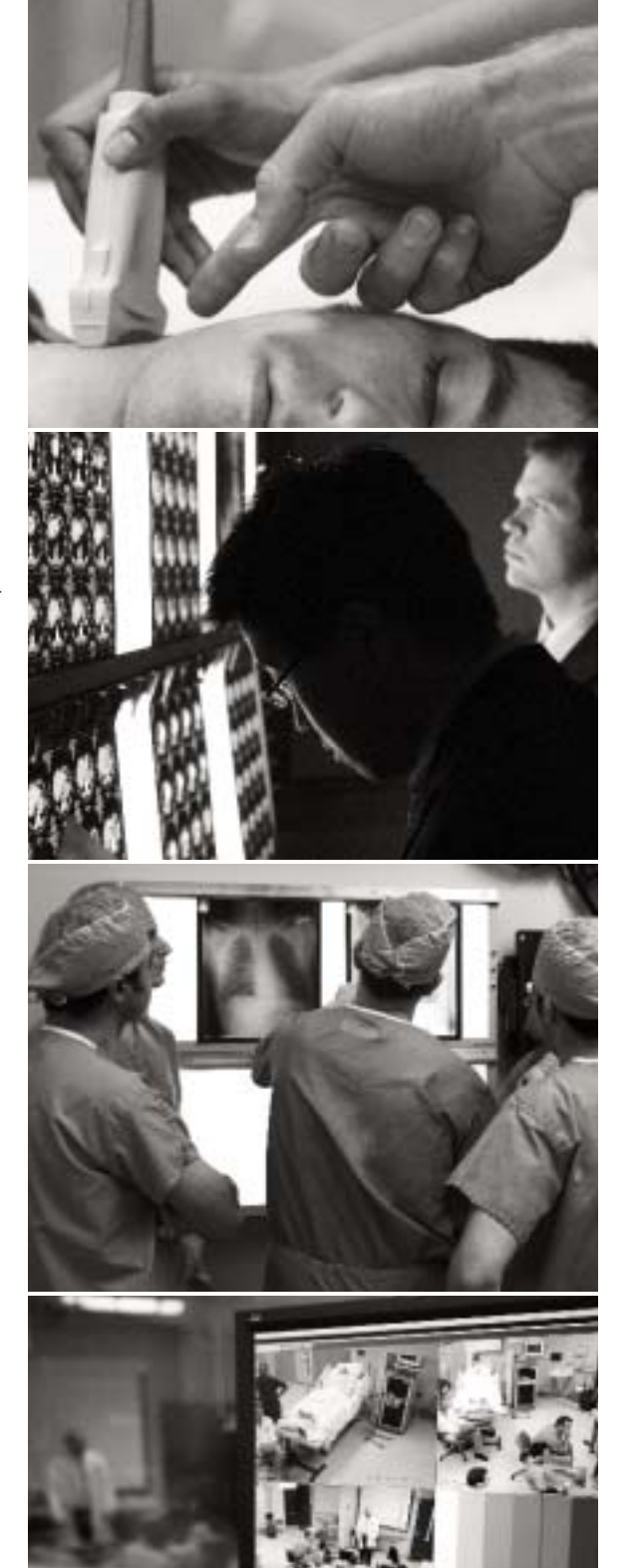
From hands-on guidance, to active role-playing in the operating suite, every scenario within the Simulation Center is recorded. Together, students and physicians review these and use as learning opportunities.

A POWERFUL TEACHER When you walk into the Mayo Clinic Multidisciplinary Simulation Center on the first floor of the Stabile Building at Mayo Clinic's campus in Rochester, the setting looks like most other clinical areas. It has a reception desk, signs that point you in the right direction, and several patient exam rooms. But, what happens there is far from ordinary.