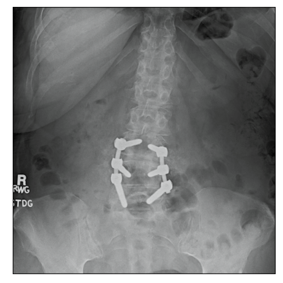
Figure. Spinal implants for treatment of lumbar scoliosis and spondylolisthesis

"A single company may not have all the instrumentation we need for all parts of the spine. With three companies we cover almost all our bases," says Mark A. Pichelmann, M.D., a neurosurgeon at Mayo Clinic in Jacksonville, Fla. "For very special needs we also have the capability to