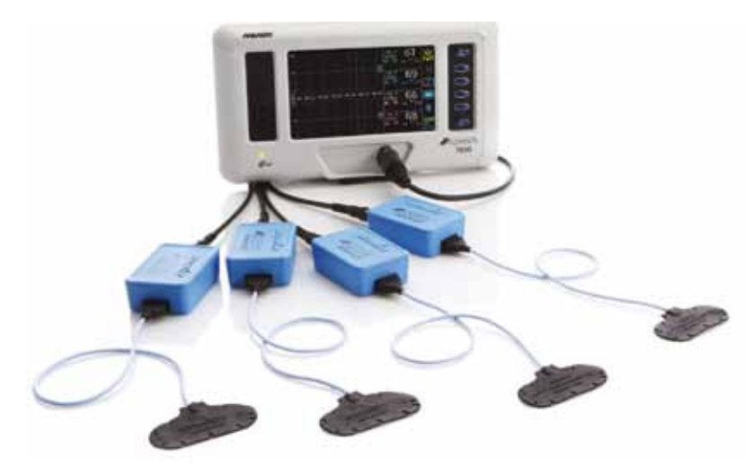
Figure. The EQUANOX<sup>TM</sup> Model 7600 cerebral/somatic regional oximeter with EQUANOX<sup>TM</sup> Advance Adult Sensors.

In addition to improving patient treatment, innovative monitoring plays a key role in Mayo's many research efforts in the neuro-ICU. Following the study of continuous EEG in therapeutic hypothermia, researchers at Mayo