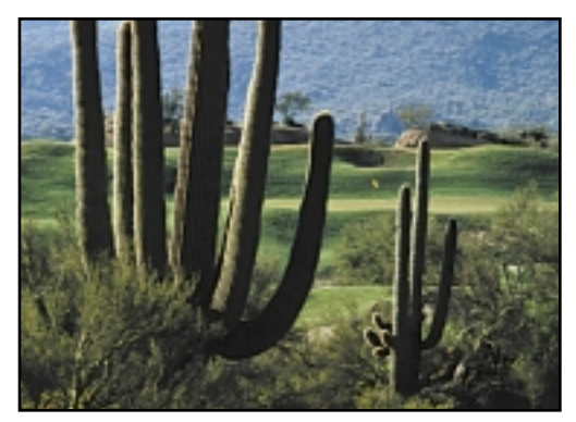
© 2003 Mayo Press Printed in the USA

If you have received a duplicate brochure, please give this brochure to a colleague.