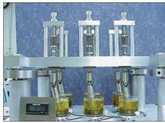
Figure 2. Wear-testing machine designed by the Mayo Clinic biomechanical orthopedics laboratory to investigate wear characteristics.

The collaboration with engineers led to some 20 years of research, supported by the National Institutes of Health, investigating biomechanical and kinematic forces in the hand and wrist of