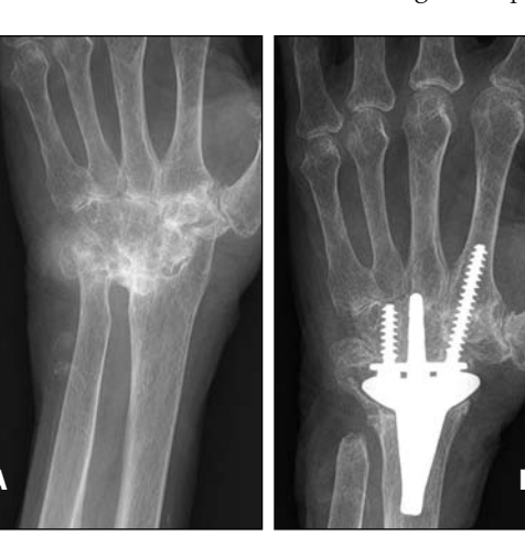
Figure 1. Treatment of advanced rheumatoid arthritis of the wrist. A, Treatment with total wrist replacement. B, Note the distal rigid fixation of the implant to the carpus and second and third metacarpals, excision of the distal ulna, and press-fit fixation of the distal radial component.

Before the advent of wrist joint replacement, orthopedic surgeons relieved wrist pain and dysfunction from posttraumatic arthritis, osteoarthritis, and rheumatoid arthritis by modifying bone, such as removing the trapezium or the distal end of the